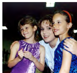
Olympian Kerri Strug

Hey, how about staff? Over the last 30 years of conducting camps and clinics, We have been privileged to have some of the most respected and knowledgeable staff available.