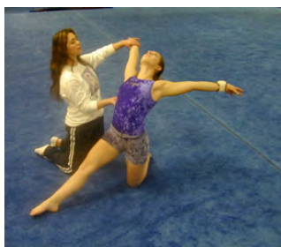
USA National AA Champ and Cirque Du Soleil performer Kristy Powell