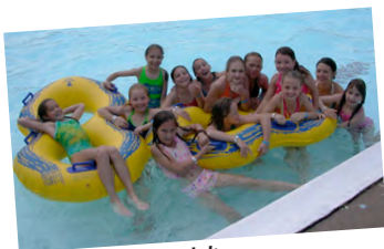
Campers enjoy a cool dip.

Whatever your choice, you can rest assure that your children have quality supervision and safety as campers are under 24-hour observation by either our adult staff in the gym or a club parent, or coach, outside the gym. For all athletes attending, our medical doctor is on call 24 hours a day.